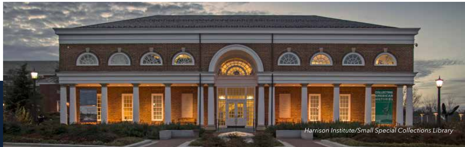
Harrison Institute/Small Special Collections Library

Tweet it to @rareUVA #101object #100objects or submit your entry online: 100objects.lib.virginia.edu/101st-object